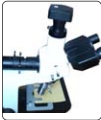
Connect with microscope