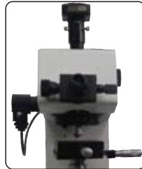
Connect with Vickers hardness tester